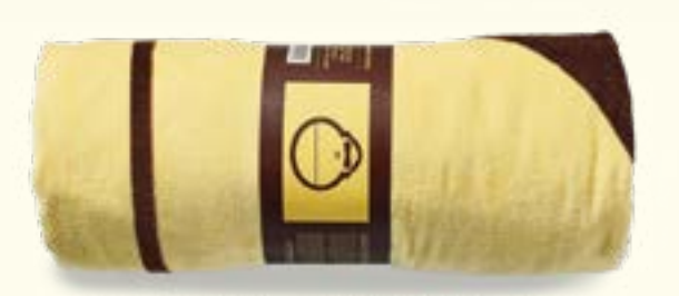
'Sonny' Beach Towel