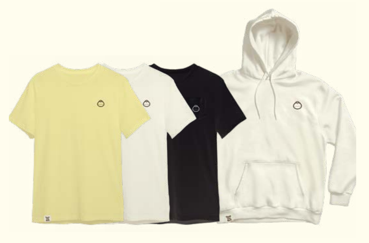
Plain Tee - Yellow/Cream Pocket Tee - Black